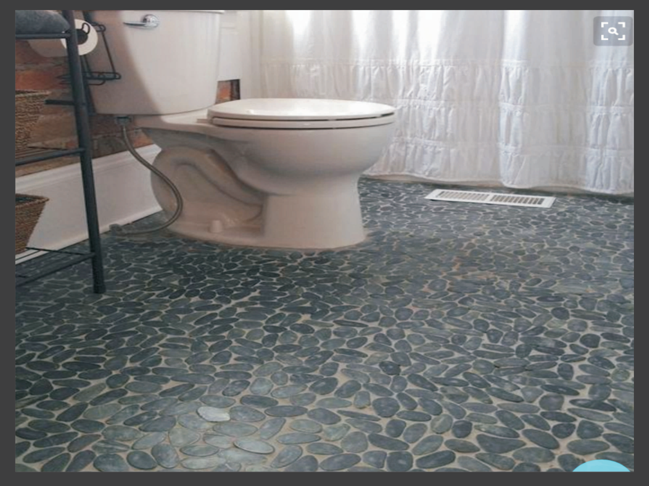
Charcoal Sliced Pebble