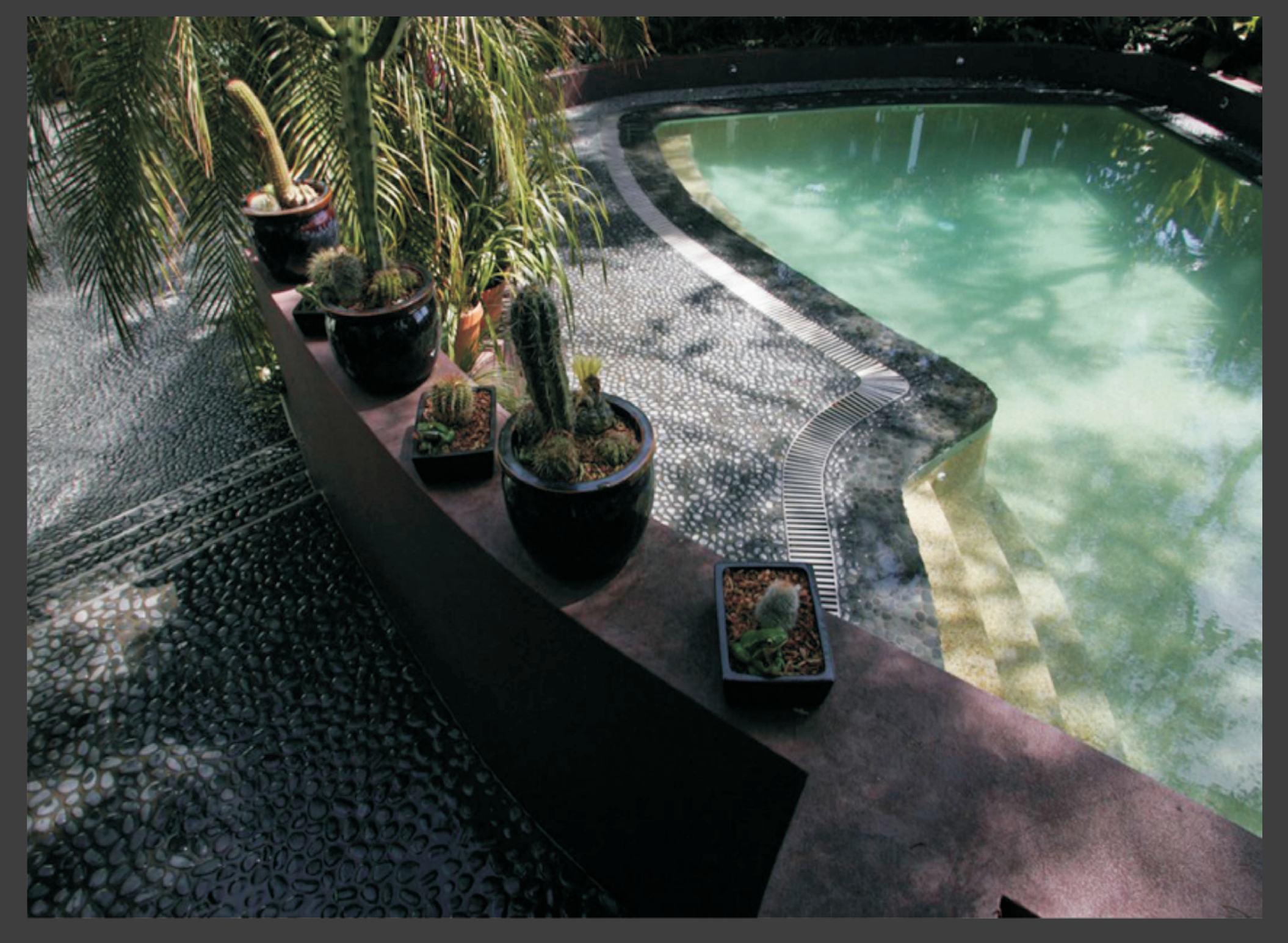
Sliced Pebble Star Black