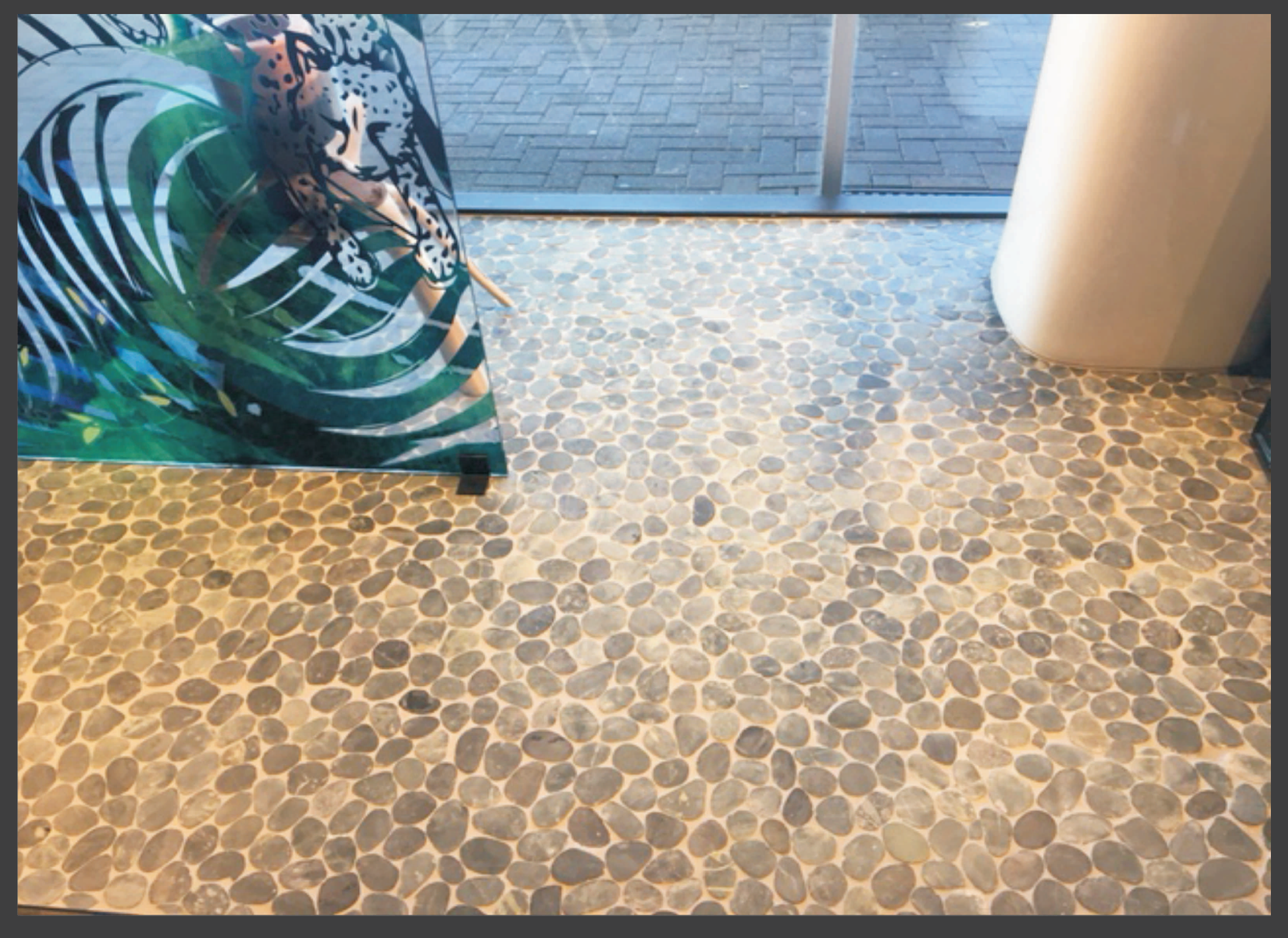
Sliced Pebble Charcoal