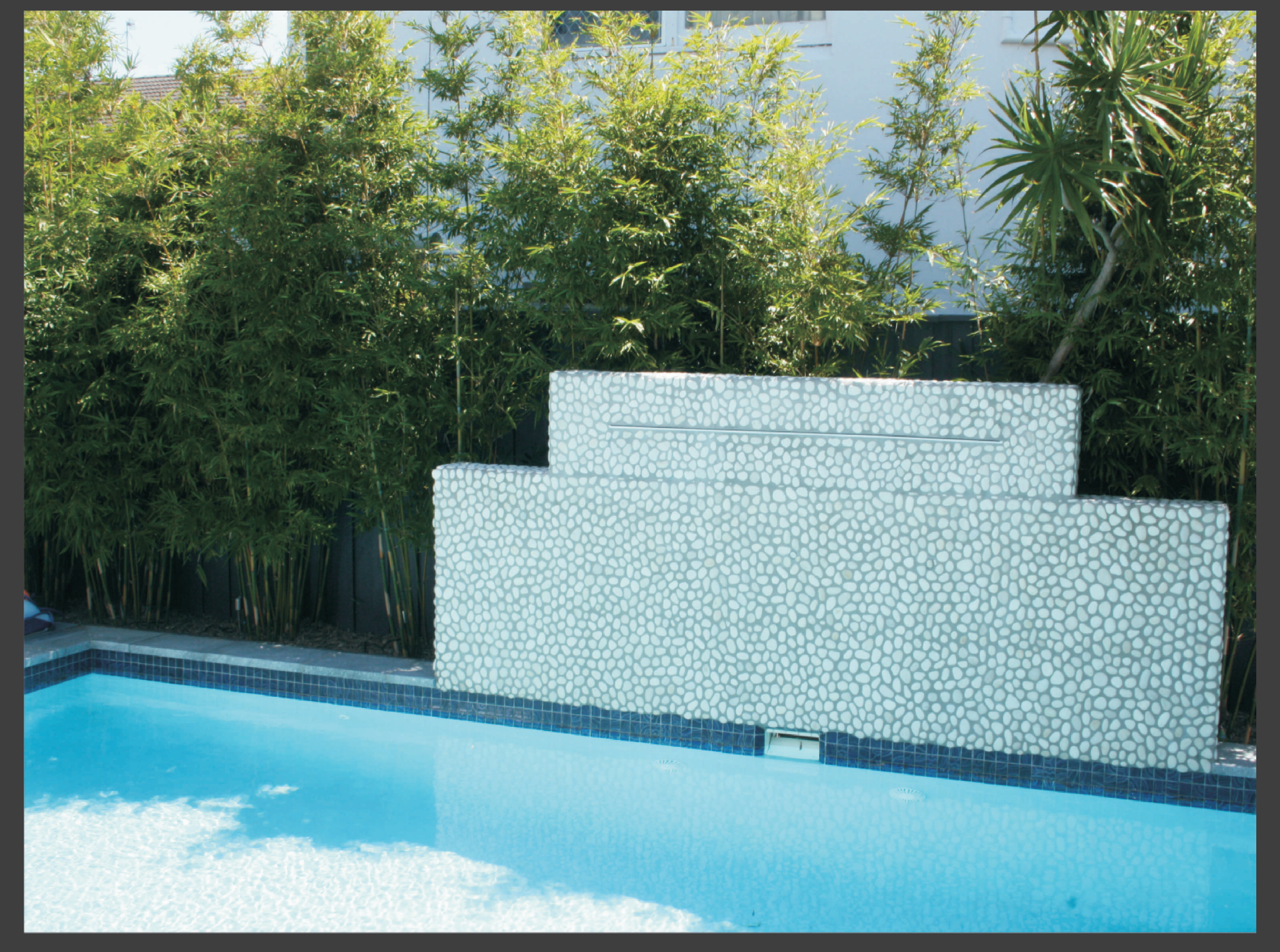
Sliced Pebble White