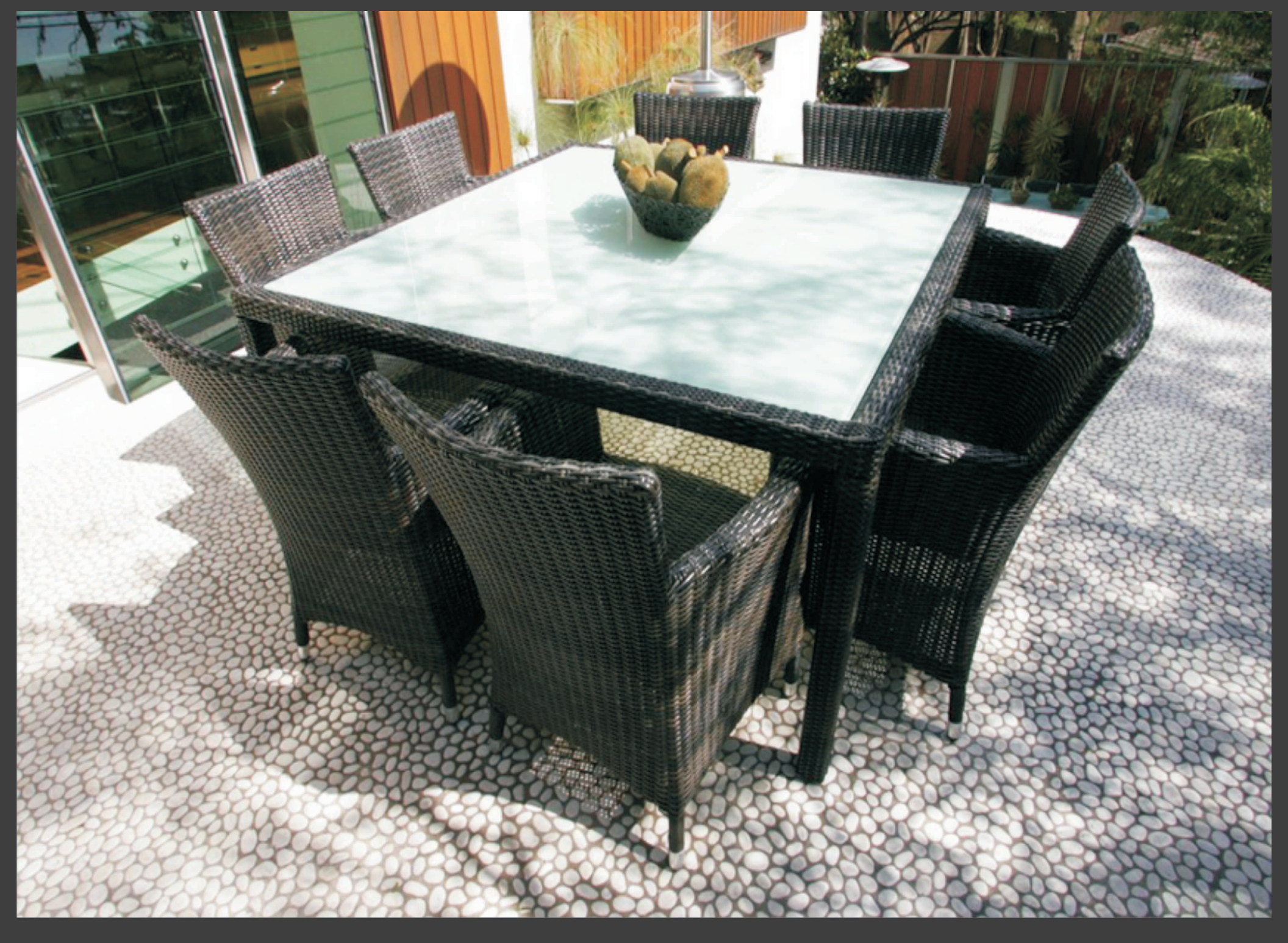
Sliced Pebble White